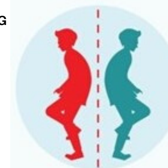
AVOID CONTACT WITH SICK PEOPLE

CORONA VIRUS OUTBREAK 24-HOUR HOTLINE NUMBER: 0800 029 999