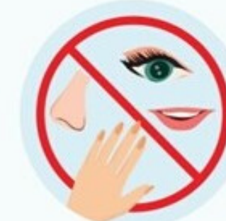
DON'T TOUCH EYES, NOSE OR MOUTH UNWASHED HANDS