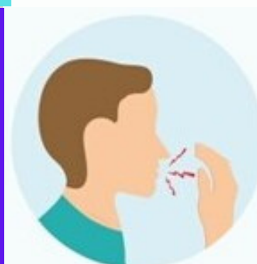
COVER YOUR NOSE AND