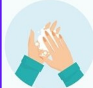
WASH HANDS WITH WATER AND SOAP/SANITIZER